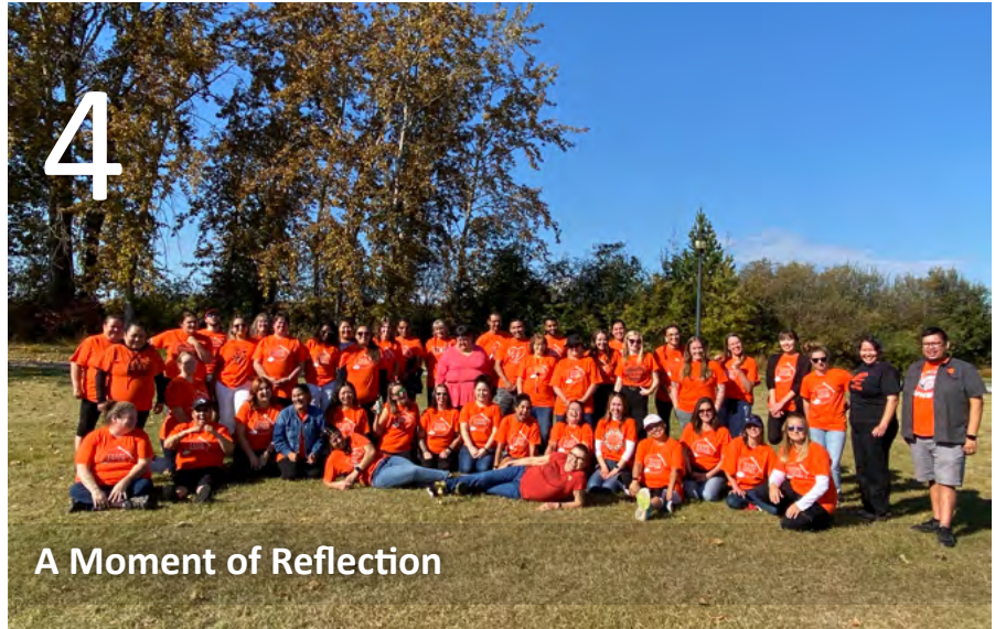
A Moment of Reflection