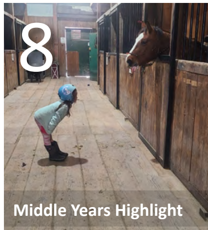
Middle Years Highlight