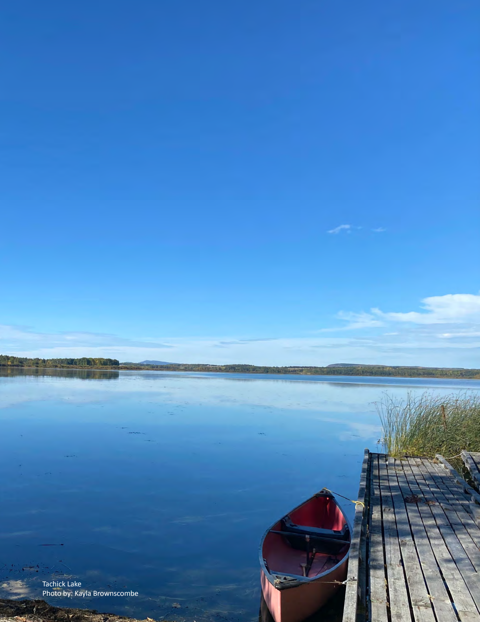
Tachick Lake