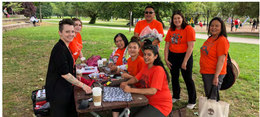
CSFS Jurisdiction Team

serve as a symbol for the constant connection we have with where we are from: "the quilt represents being wrapped and acknowledged in the warmth, the love and the support of CSFS even when members are far away. The quilt represents that connection."