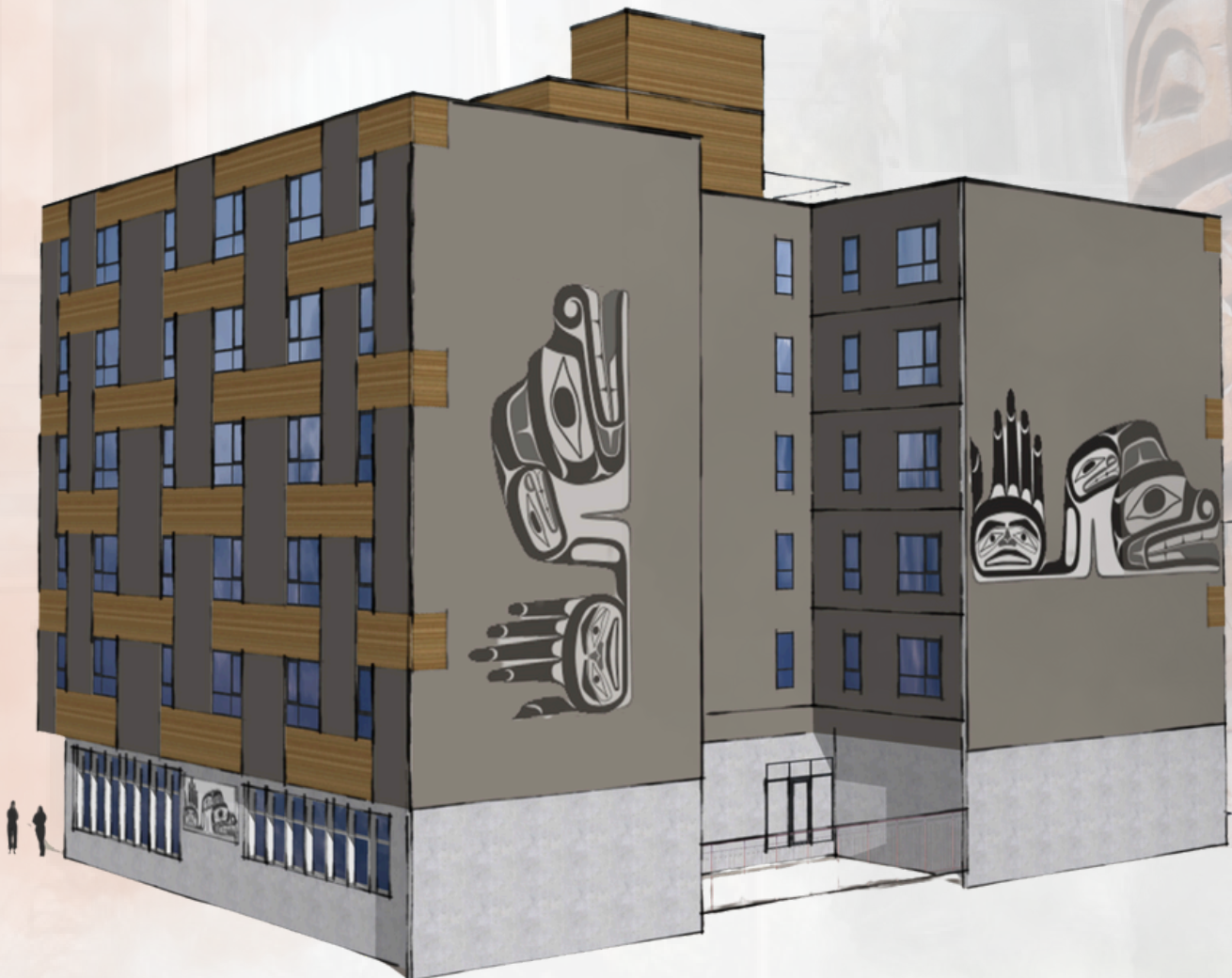
Proposed architectural rendering of new building project

Closing Date: November 28, 2025 at 2:00pm