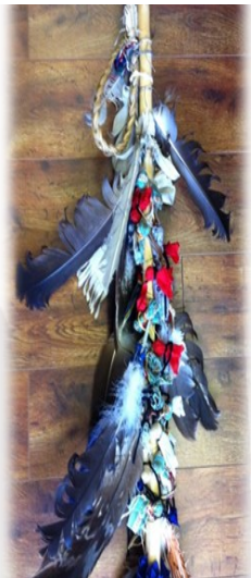
The Eagle Feather Staff was brought on horseback from the Elders from Lillooet BC to Prince George in July of 2010.

In 2006 Carrier Sekani Family Services (CSFS), took part in a symposium to raise public awareness about the Highway of Tears and create a call for action.