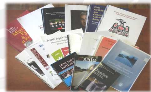
Community Safety Toolkit Resources