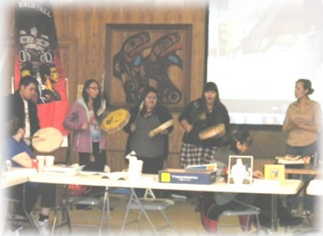
Youth presentation at the Community Safety Training in Prince George, BC