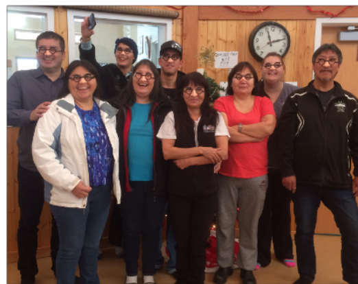
Community Engagement Meeting held in Takla, Nov 29, 30, and Dec 1, 2017

Feel free to contact the Child & Family Services Team if further information is required or if any additional reading material is required on the work to date.